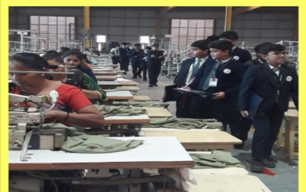
D.R. Garment, Vanana GIDC