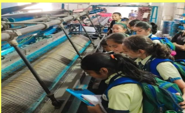
Krishna Synthetic, Porbandar GIDC